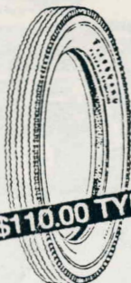
450x21 DELUXE CHAMPION

450x21 Firestone Deluxe Champion 4 ply tyre suitable for Ford A, Chevrolet, Whippet etc. Top quality Firestone product.