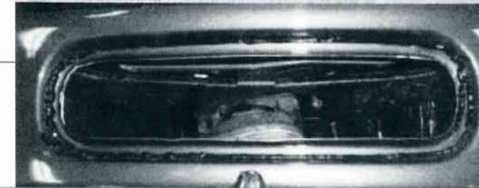
Right top to bottom Failed attempt number 2. Two different rubber seals. Sikaflex 291 applied to the opening.