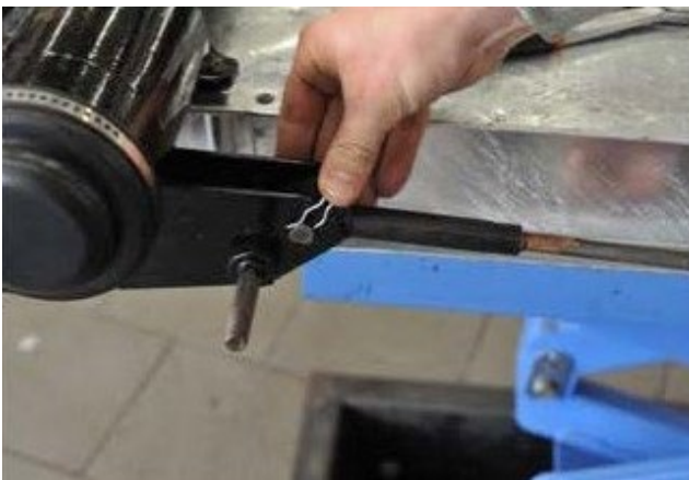
Photo 4 (left) shows a knife edge retaining clip being fitted into the grooved end of the knife edge after the knife edge has been passed through the mounting brackets and the tie-rod eye.

Photo 3 (left) shows a suspension tie-rod at lower right, fitted with its screwed-on tie-rod eye. The “nut” section at the end of the eye fits centrally between the two mounting brackets shown, locked in place by the knife edge which is ready to be inserted into position in the openings in the brackets. The brackets are fitted to the suspension arm assembly. The “nut” of the tie-rod eye is ready to be raised into position between the brackets, after which the knife edge is inserted into one bracket, passes through the “nut” of the tie-rod eye and out through the other bracket, then is locked in place in the brackets by retaining clips at each end. The large pin at lower left is a shock absorber mounting spindle.