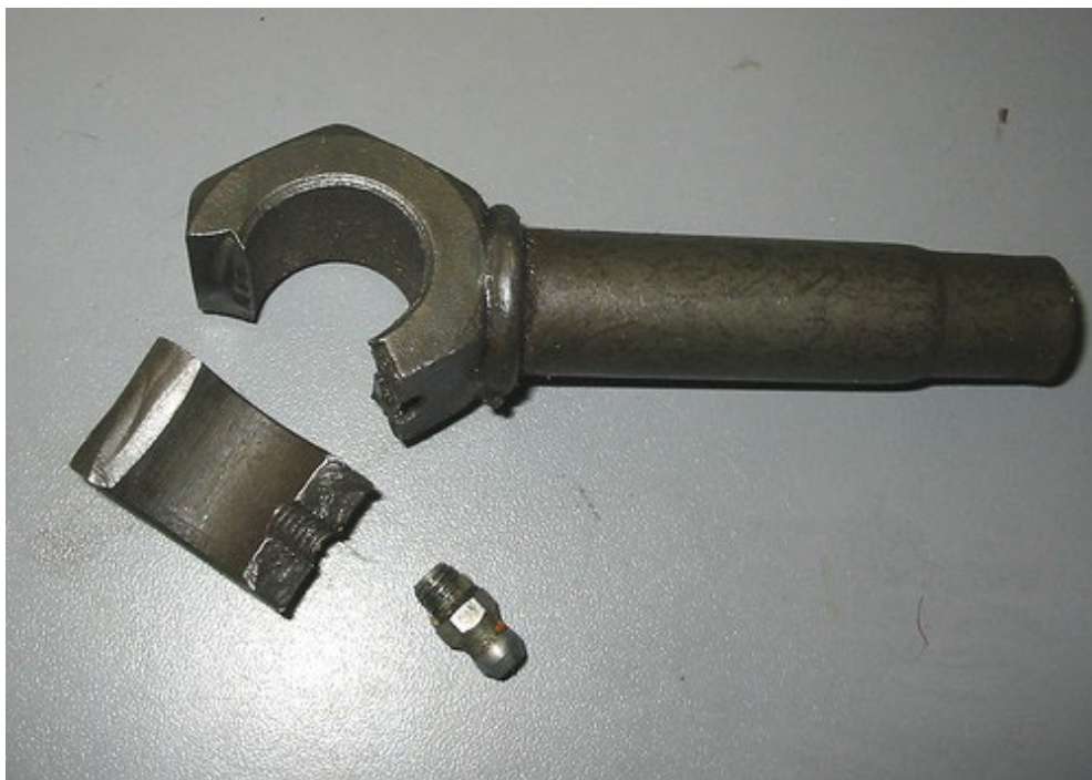
Photo 7: Suspension Tie-Rod Eye destroyed by a modification to fit a grease nipple

My grateful appreciation and acknowledgement is given to the web sites from which images have been accessed.