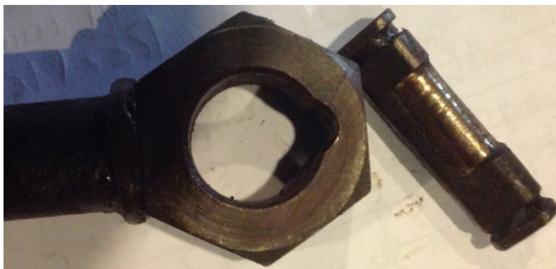
Photo 5: Well-worn “nut” on the Tie-Rod Eye and well-worn Knife Edge. Both items are due for immediate replacement. Don't attempt to repair them!