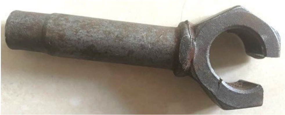
Photo 6: Suspension Tie-Rod Eye broken on Raid Cape York 2022