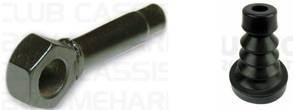
Photo 2: Suspension Tie-Rod Eye (left) and Suspension Tie-Rod Boot.

A suspension cylinder lies along each side of the chassis under the vehicle. A suspension tie-rod exits from each end of the suspension cylinders, and a suspension tie-rod eye (Photo 2) is screwed onto the threaded end of each tie-rod. Each tie-rod eye is held in position between the mounting brackets by a knife edge and retaining clips. A suspension tie-rod boot (Photo 2) is fitted over each tie-rod at its exit point from the suspension cylinder.