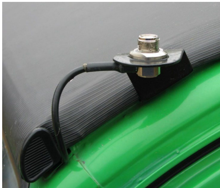
Photo 3: Antenna mounting base fitted to the mounting bracket with the antenna whip removed. Ensure the coaxial cable is not kinked, jammed in, deformed, caught, folded in a tight radius or damaged in any way to ensure it operates at its maximum performance with maximum reliability and longest life. The antenna base's chromed mounting fixture, shown above, is a well-engineered fitting.

The photo above shows the writer's antenna mounting bracket fitted to his orange 2CV, positioned forward on the inside edge of the metal roof structure on the passenger's side. It locates the base of the antenna near the highest point on the vehicle. Ensure the mounting face of the antenna bracket is dead horizontal so the antenna is positioned at true vertical to maximise communication range. Yes, check with the spirit level as it's vitally important. The bracket shown here is the writer's experimental one! The second bracket, in the photos which follow, has less holes drilled in it!