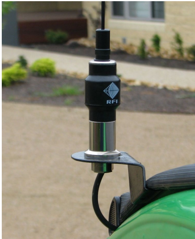
Photo 6: Antenna screwed onto its mounting base. Hand-tighten only.