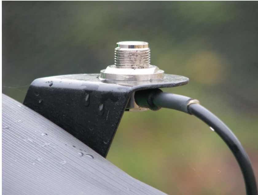
Photo 4: Close-up of antenna MBC mounting base, minus the plastic dust cap.

A small plastic dust cap (not shown in these photos) is supplied with the antenna for screwing onto the threaded mounting base to protect it from damage from dust, stones, water etc whenever the antenna is removed for stowage.