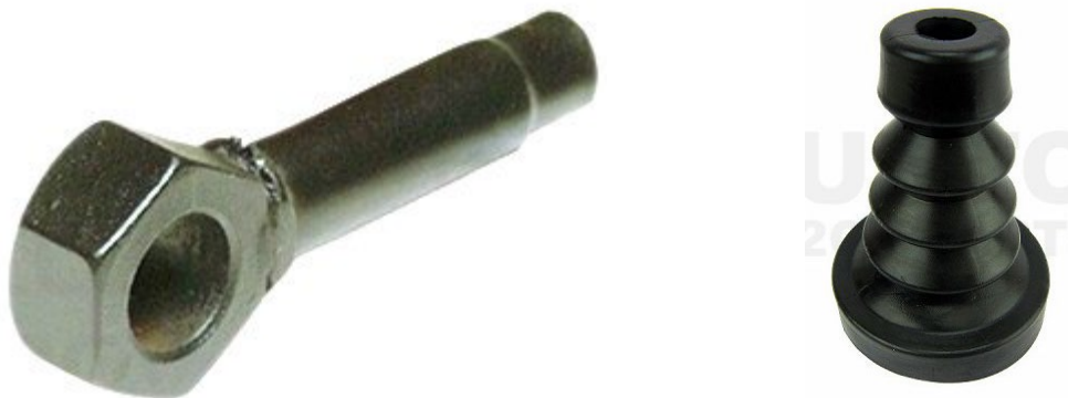
Photo 2: Suspension Tie-Rod Eye (left) and Suspension Tie-Rod Boot.

A suspension cylinder lies along each side of the chassis under the vehicle. A suspension tie-rod exits from each end of the suspension cylinders, and a suspension tie-rod eye (Photo 2) is screwed onto the threaded end of each tie-rod. Each tie-rod eye is held in position between the mounting brackets by a knife edge and retaining clips. A suspension tie-rod boot (Photo 2) is fitted over each tie-rod at its exit point from the suspension cylinder.