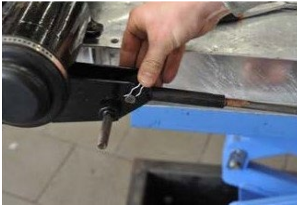
Photo 4 (left) shows a knife edge retaining clip being fitted into the grooved end of the knife edge after the knife edge has been passed through the mounting brackets and the tie-rod eye.

Photo 3 (left) shows a suspension tie-rod at lower right, fitted with its screwed-on tie-rod eye. The “nut” section at the end of the eye fits centrally between the two mounting brackets shown, locked in place by the knife edge which is ready to be inserted into position in the openings in the brackets. The brackets are fitted to the suspension arm assembly. The “nut” of the tie-rod eye is ready to be raised into position between the brackets, after which the knife edge is inserted into one bracket, passes through the “nut” of the tie-rod eye and out through the other bracket, then is locked in place in the brackets by retaining clips at each end. The large pin at lower left is a shock absorber mounting spindle.